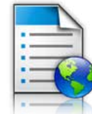
Forms and Favourites